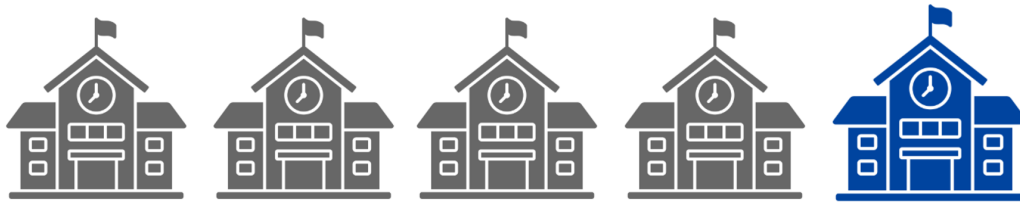
Holy Trinity CE Primary Academy

1% higher than the median attendance of similar schools. This means 16 schools have lower overall attendance than yours.